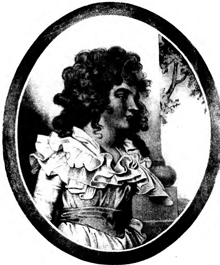
HER GRACE the DUCHESS of DEVONSHIRE

Portrait by Sir Godfrey Kneller, 1685. Engraved by J. Smith, 1780.